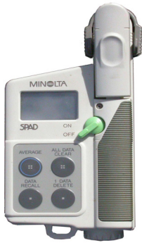
Figure 1. The Minolta SPAD 502.

The leaf area measured by each handheld meter also differs. The SPAD 502 measures a 0.06 cm 2 area while the CCM-200 a 0.71 cm 2 area.