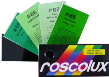
Figure 3. Roscolux Colored Filters.

Measurements were taken using Minolta SPAD 502 and Opti-Sciences CCM-200 handheld chlorophyll meters. Measurements were taken on Roscolux colored plastic filters (Figure 3) and then on leaves of a ficus benjamina tree. Plastic filters were used as leaf models because of their similarity to leaf spectra and their uniformity of color. SPAD data was then plotted against the CCM data and regressions were plotted.