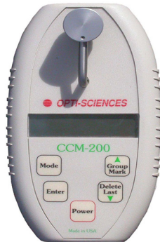
Figure 2. The Opti-Sciences CCM-200.